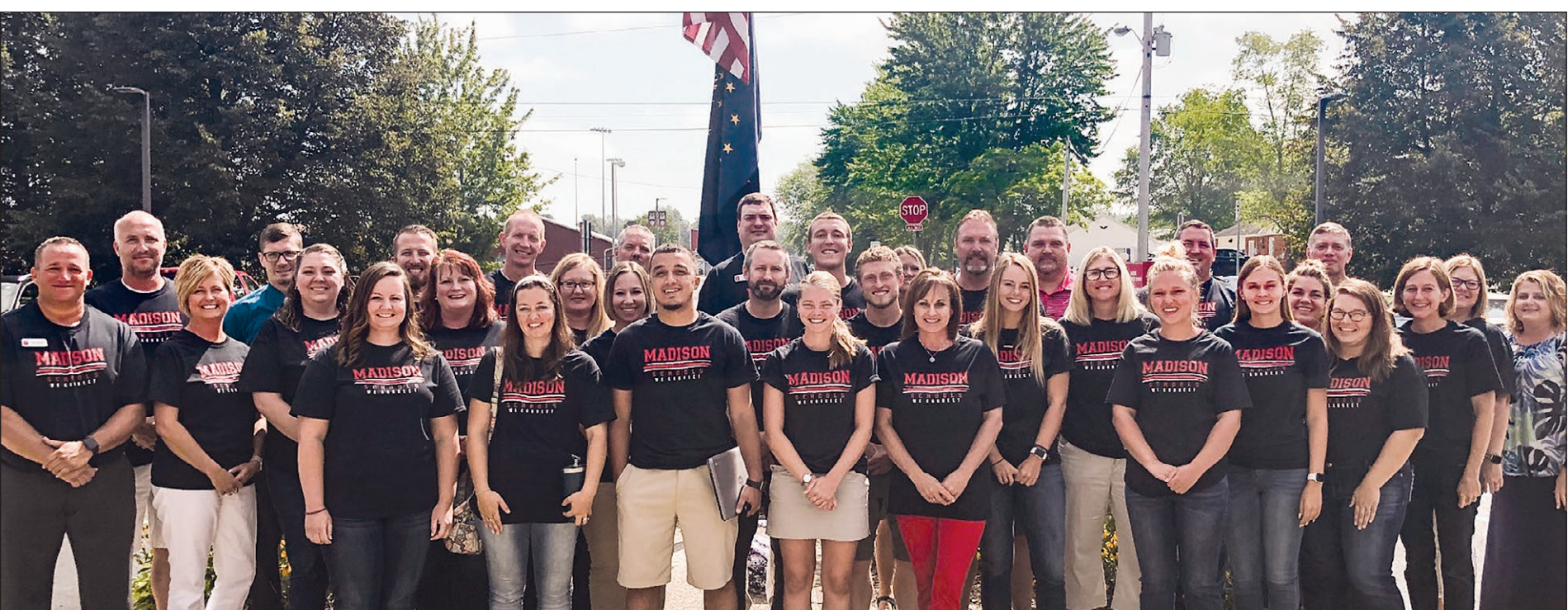
The new recruits pose with district administrators in front of the MCS Administration Building after completing new-teacher orientation.