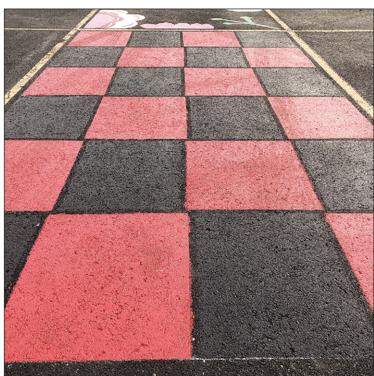
Nearly 40 Madison Consolidated High School seniors signed up to participate in a prom fund-raiser, paying $20 each for the privilege of painting their very own parking space.