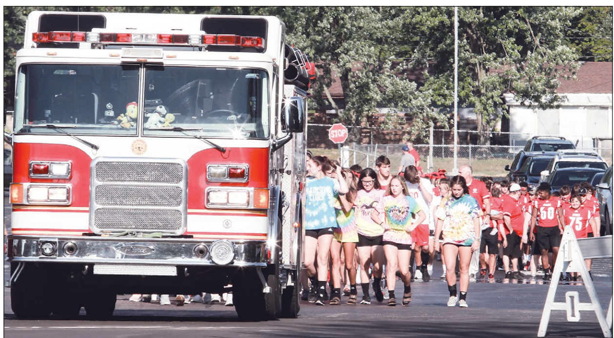
Above, Cubs volleyball and football teams head up the parade of athletes, led by an engine from Madison Fire Department Clifty Station 6.

Varsity Volleyball Sept. 26 Jeffersonville Sept. 28 @ Bedford North Lawrence Oct. 1 @ Jennings County Oct. 3 New Albany Oct. 5 Christian Academy of Indiana Oct. 8 @ Columbus East Oct. 10 Floyd Central Oct. 15, 17, 19 IHSAA Sectionals @ Silver Creek (Game draws will be made to determine dates)