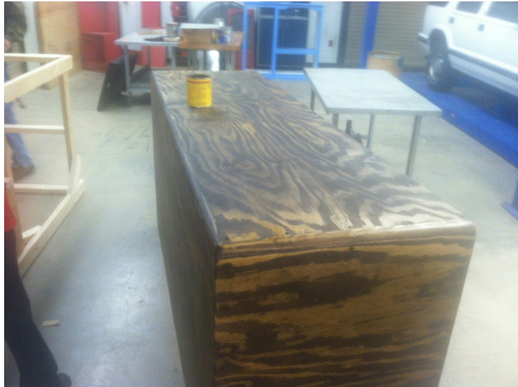
The first coat of stain on the church table.