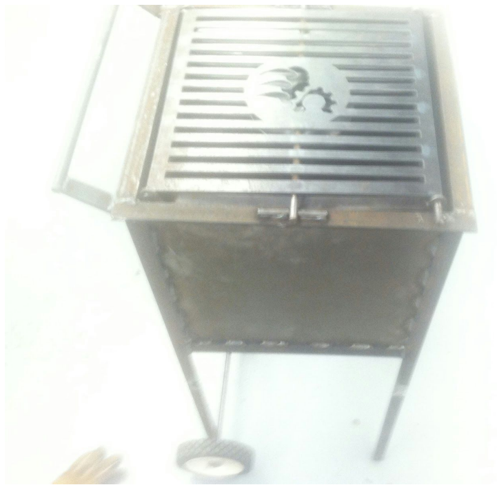
All the different angles of the finishes second prototype of the chicken grill. We have yet to test it.