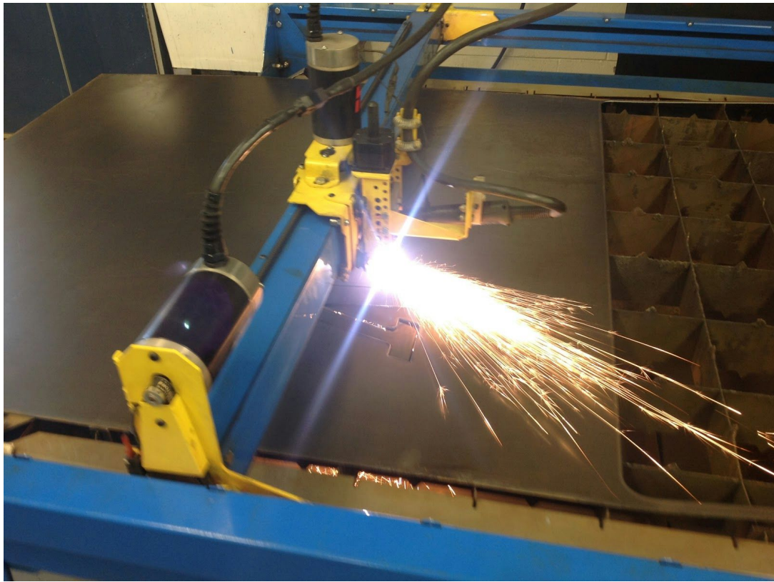
The PlasmaCam cutting out the design for M&M