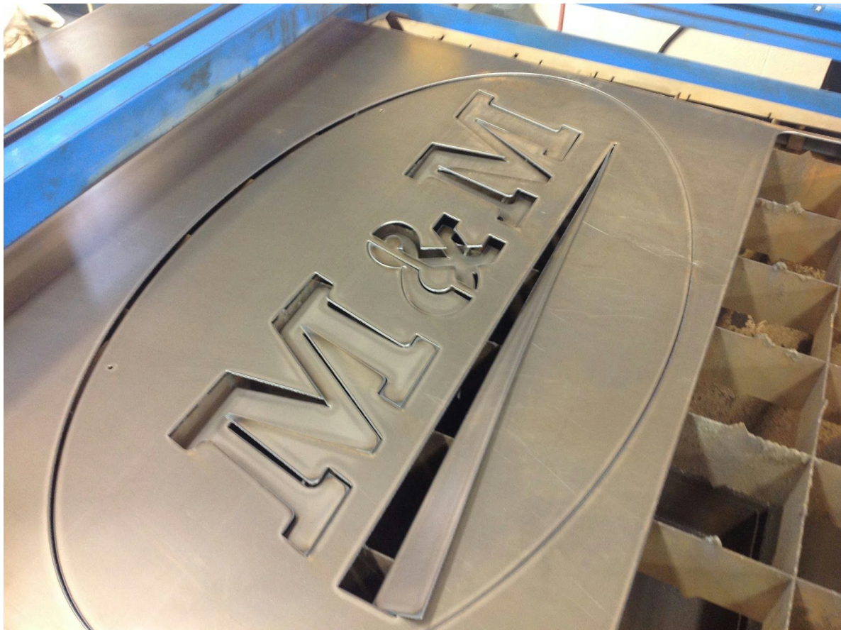
Is anyone missing an M&M?