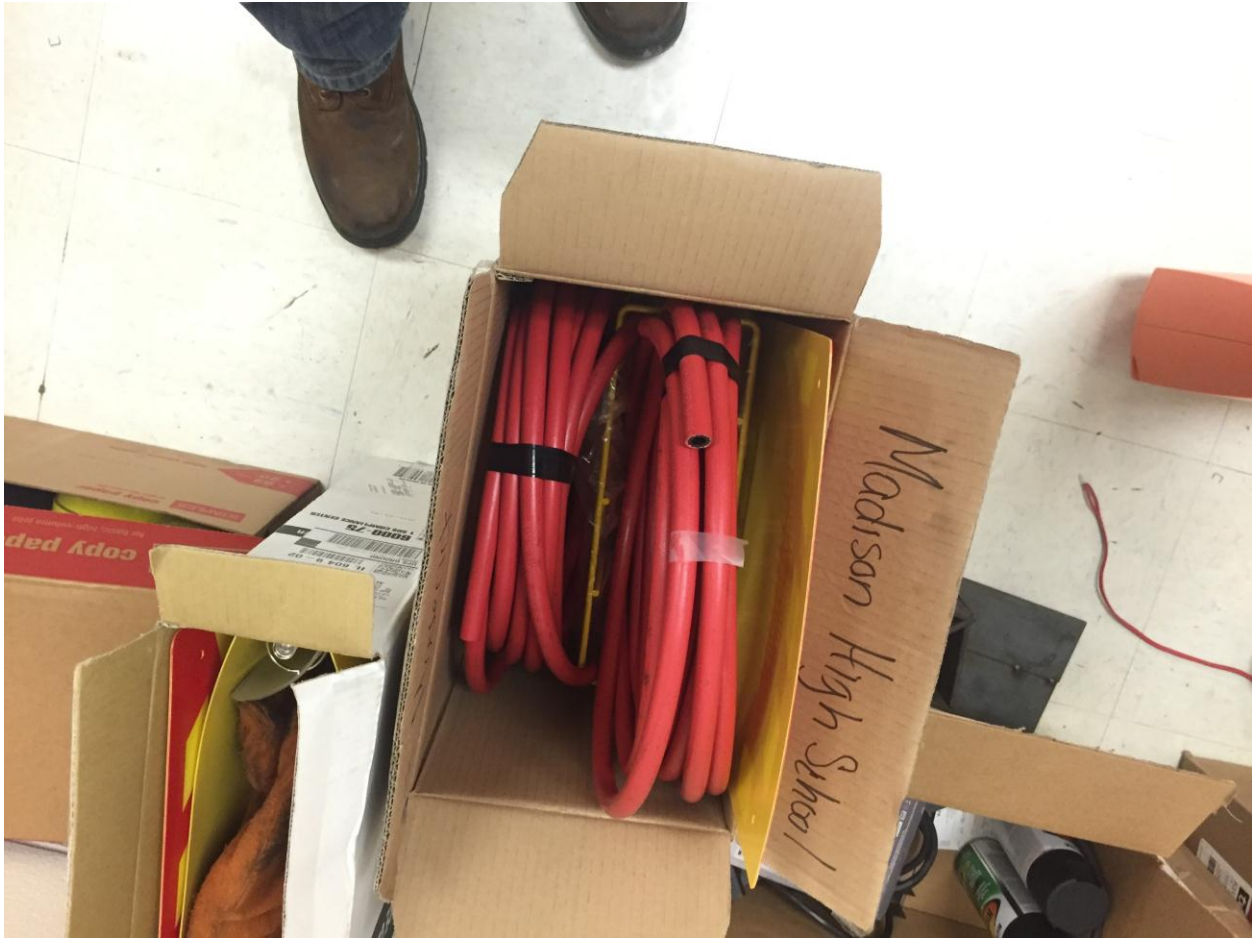
The donations from IKEC