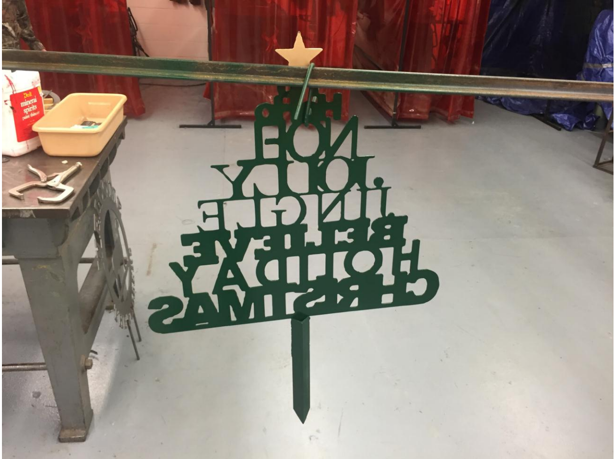
Tree ordered from us.