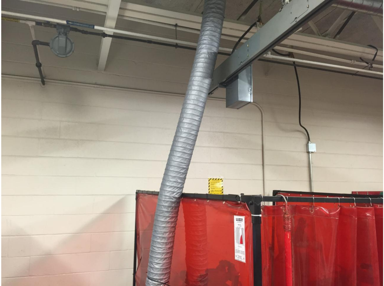
A vent tube that leads from our ventilation system to the PlasmaCam courtesy of Terry's Heating and Cooling .