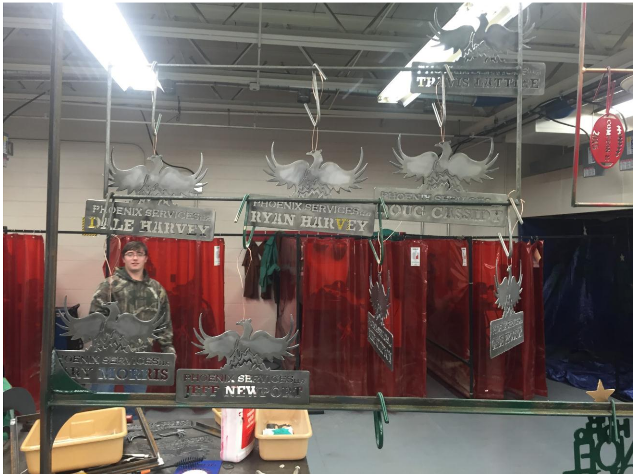
Some of the Phoenix signs that we have designed and cut out. As you can tell they catch the attention of everyone.