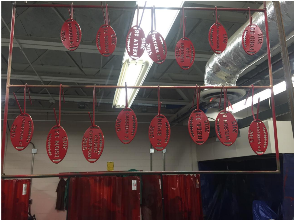
Football awards for the football team.