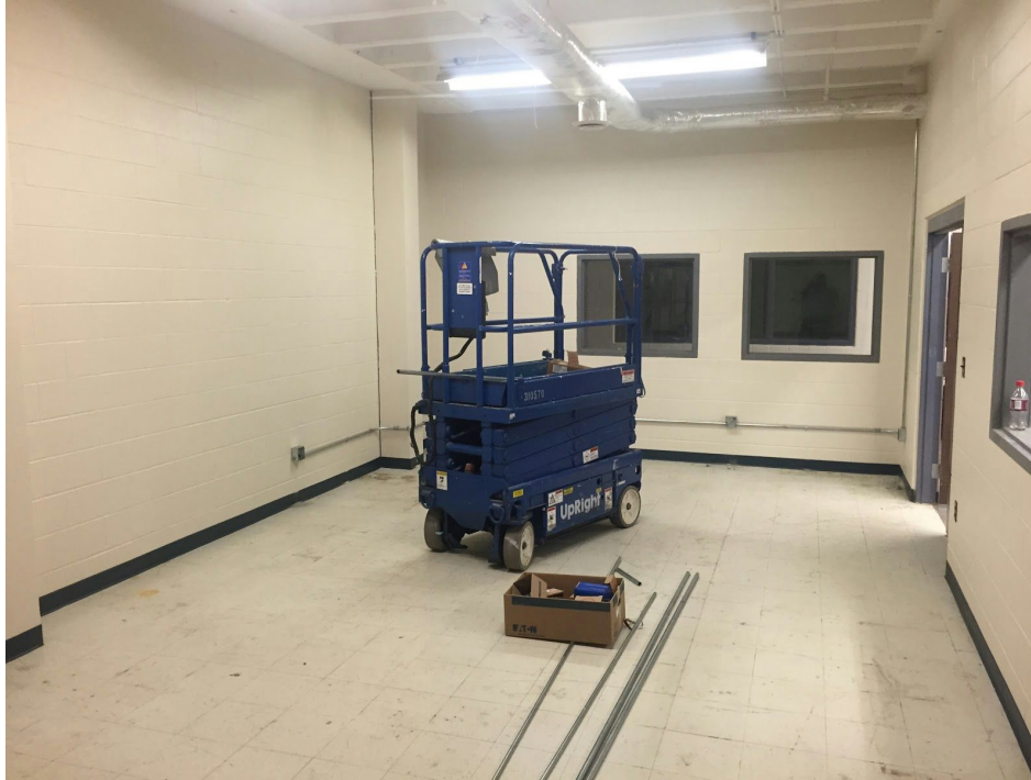
The maintenance men have been hard at work preparing the Amatrol lab with proper electrical outlets.